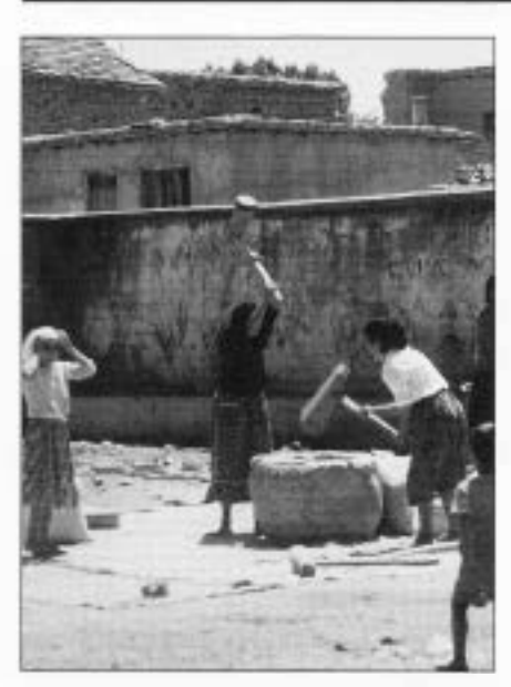
Figure 3 Women in a Turkish village debranning grain for bulghur using a large stone mortar and wooden mallets, 1991.

readily. When bread wheat is threshed, it is easy to free the grain from the ear, but when emmer is threshed the ear falls apart into little packets which are known as spikelets. They consist of the grain tightly enclosed in chaff. Skilled extra work is needed to break up the chaff to free the grain without crushing it.