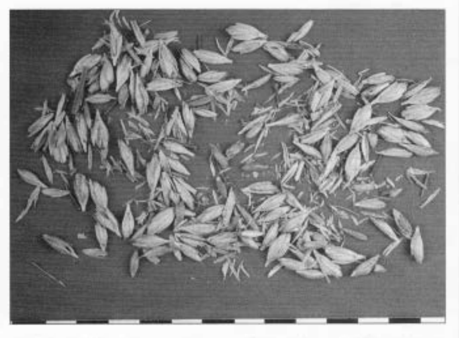
Figure 7 The shredded emmer chaff generated by experimental pounding as shown in Figure 6, together with whole, freed grain (scale bar intervals 1 cm).

Although hand milling is rightly considered an arduous process, using an emplacement to raise the grindstone off the ground makes milling much quicker and easier. The miller is in close control of the grinding process, and the texture of the flour can be adjusted precisely. A few strokes of the handstone against the lower