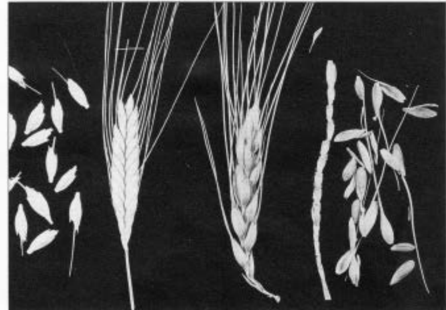
Figure 2 Threshed hulled wheat (left) and free-threshing wheat (right). The threshed hulled wheat ear falls apart into spikelets whereas the chaff of free-threshing wheat falls cleanly away from the grain.

Because emmer is so seldom cultivated today and is unfamiliar to many people, most of those who have studied ancient Egyptian bread have not appreciated how much it differs from bread wheat, the cereal now normally used for baking. Emmer is a hulled wheat, in which the grains are enclosed by tough scale-like bracts that, when threshed, produce a lot of chaff. Its ears have two main characteristics that make it more difficult to process than bread wheat, which is not hulled and which threshes freely (Fig. 2). The central stalk of the emmer ear breaks apart fairly easily, but the chaffy bracts surrounding the grain are very tough and hard to remove. In contrast, the stalk of the breadwheat ear is tough but the chaff falls away