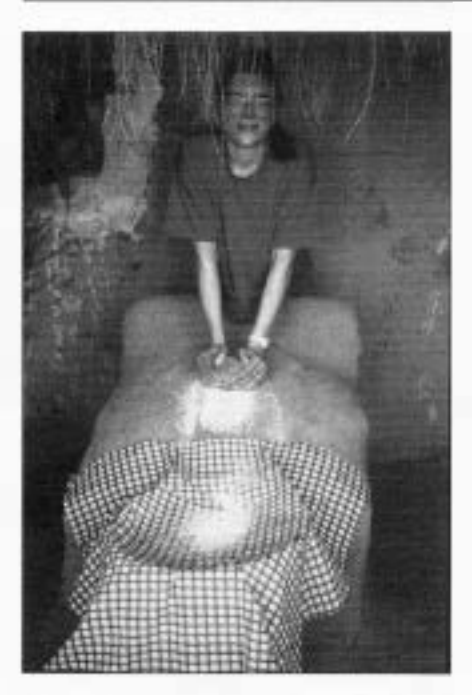
Figure 8 The author grinding flour with an ancient Egyptian handstone and grindstone set in a replica emplacement.

flatstone produces a coarse meal, and several more strokes rapidly create a fine flour (Fig. 8). Like the pounding process, however, the milling sequence must be repeated over and over again because only a small quantity of grain can be processed at a time.