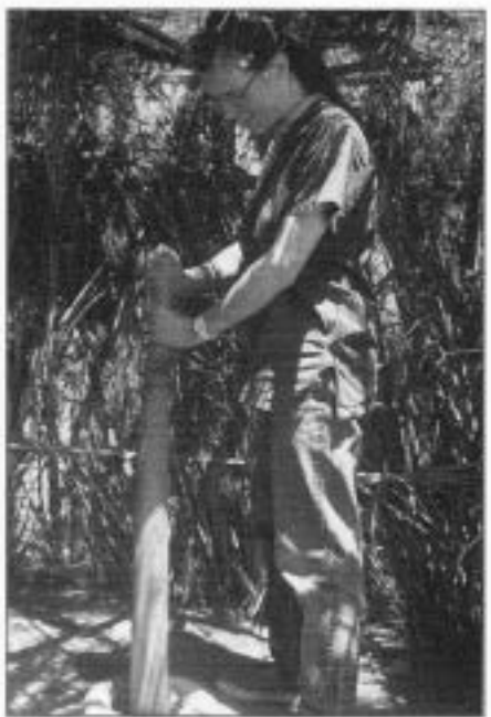
Figure 6 The author using an ancient Egyptian limestone mortar and replica wooden pestle to de-husk emmer wheat.

ing and the noise made by the pestle on the contents of the mortar change when the spikelets are shredded, so it would have been easy to tell when to stop. Apart from